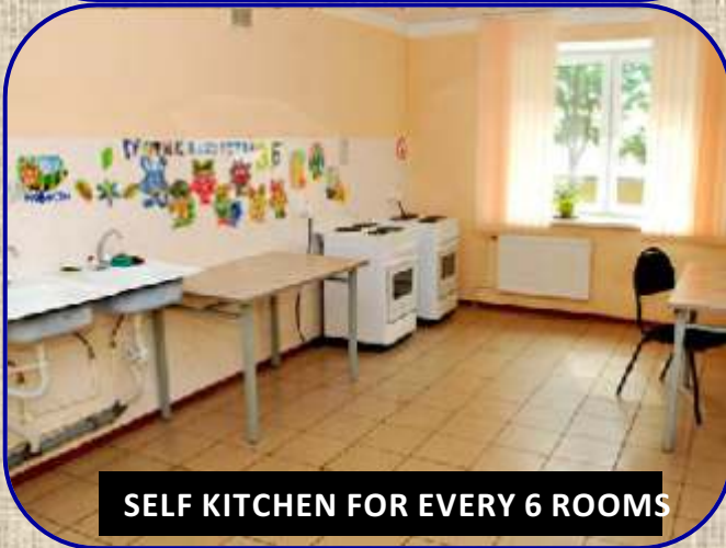
SELF KITCHEN FOR EVERY 6 ROOMS