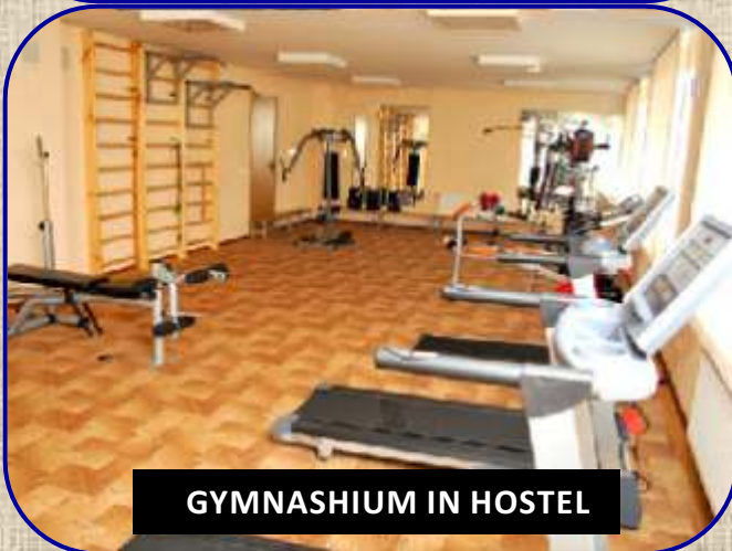
GYMNASHIUM IN HOSTEL