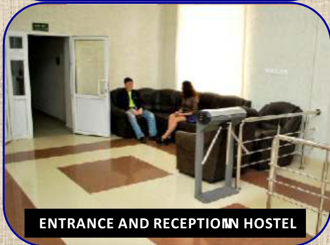
ENTRANCE AND RECEPTION IN HOSTEL