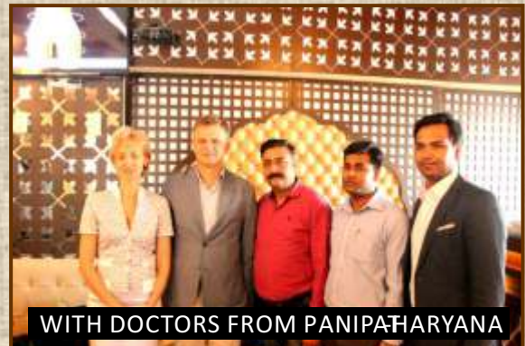
WITH DOCTORS FROM PANIPATHARYANA