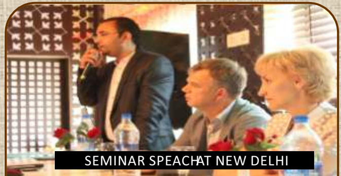
SEMINAR SPEECH AT NEW DELHI