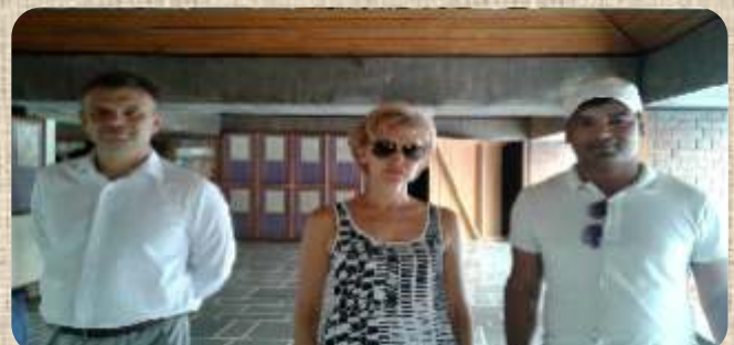
VISIT TO THE GANDHI ASHRAM, GUJARAT