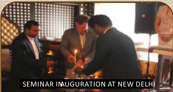
SEMINAR INAUGURATION AT NEW DELHI