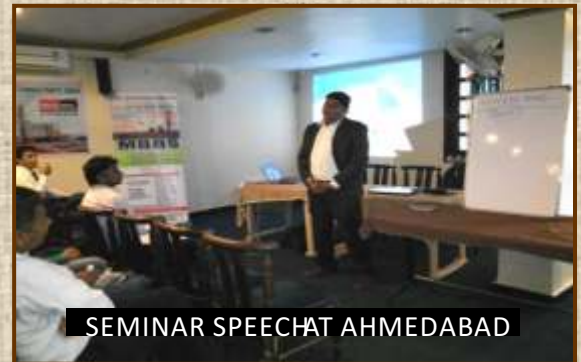
SEMINAR SPEECH AT AHMEDABAD