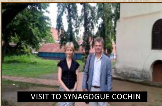
VISIT TO SYNAGOGUE COCHIN