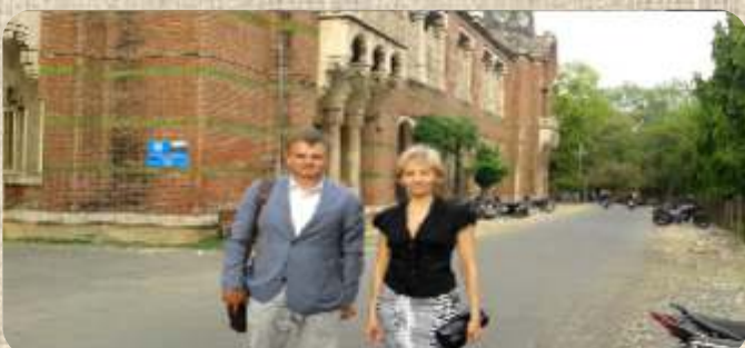
IN FRONT OF VADODARA UNIVERSITY