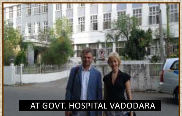
AT GOVT. HOSPITAL VADODARA