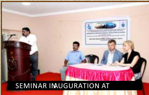
SEMINAR INAUGURATION AT