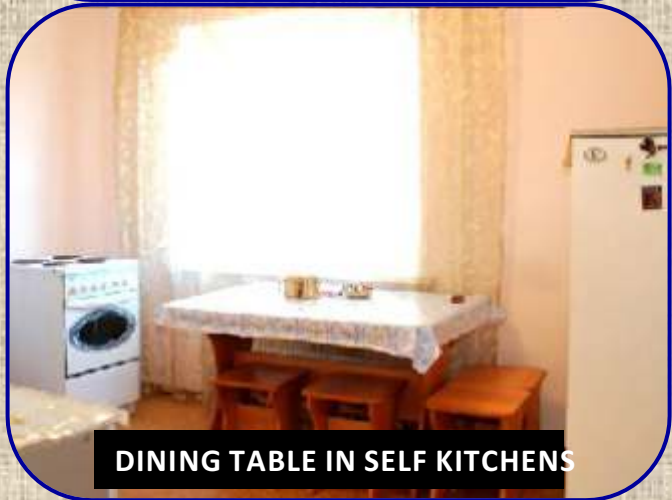
DINING TABLE IN SELF KITCHENS