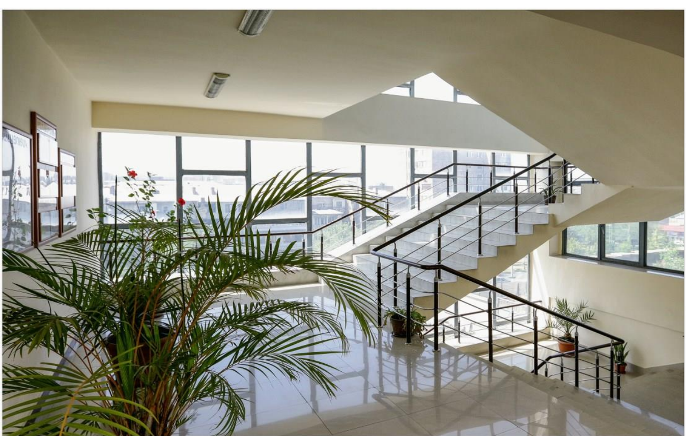
University of Traditional Medicine of Armenia